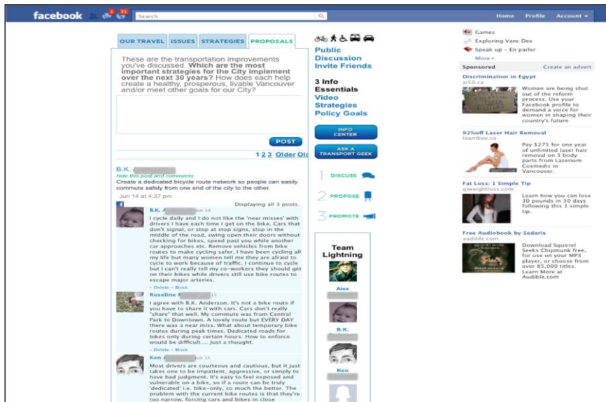
Figure 2: An EVTF discussion group.

conversation, along with the capacity to review older, archived conversation threads, gave participants the means to produce more 'reasoned' contributions, a signifier of purposive discourse (Stromer-Galley, 2007), it resulted in less orderly and less focused discussion. EVTF moderators mitigated this tendency for 'standalone' posts and replies by facilitating discussions in multiple, smaller, simultaneous discussion threads.